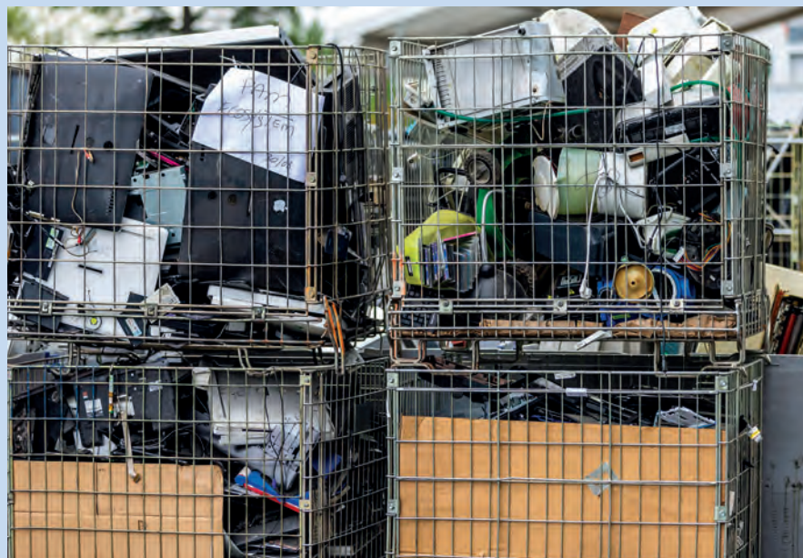
E-scrap stocks at Envie in Portet-sur-Garonne near Toulouse.

While the goals were quickly set, a pressing question remained: who could be a technological partner? Envie needed state-of-the-art tearing