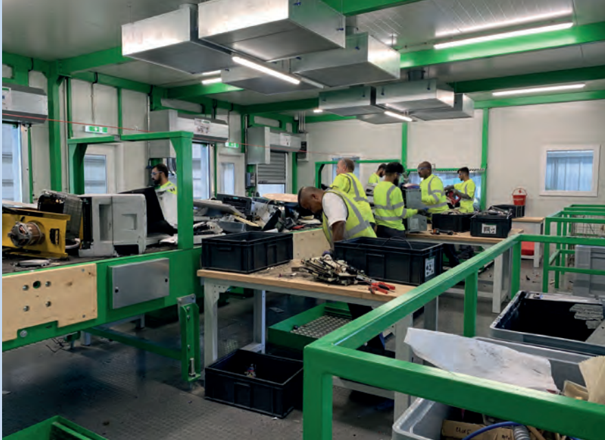
At the first stage, contaminants such as batteries, capacitors, cables, toner cartridges, display screens, circuit boards or solid parts are dismantled and processed during manual pre-sorting.