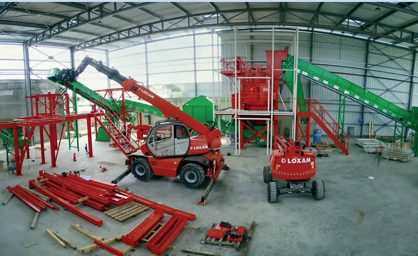
During the construction and assembly phase, the BHS Rotorshredder (type RS) can be seen in the background inside its noise protection housing.

Most people use electronic devices without giving much thought to the end of their lives. Envie, a French specialist in the recycling of electrical and electronic scrap, focuses on safety and sustainability. To do so, the company has two technological aces up its sleeve: a primary shredder (VSR) and a Rotorshredder (RS) from BHS-Sonthofen.