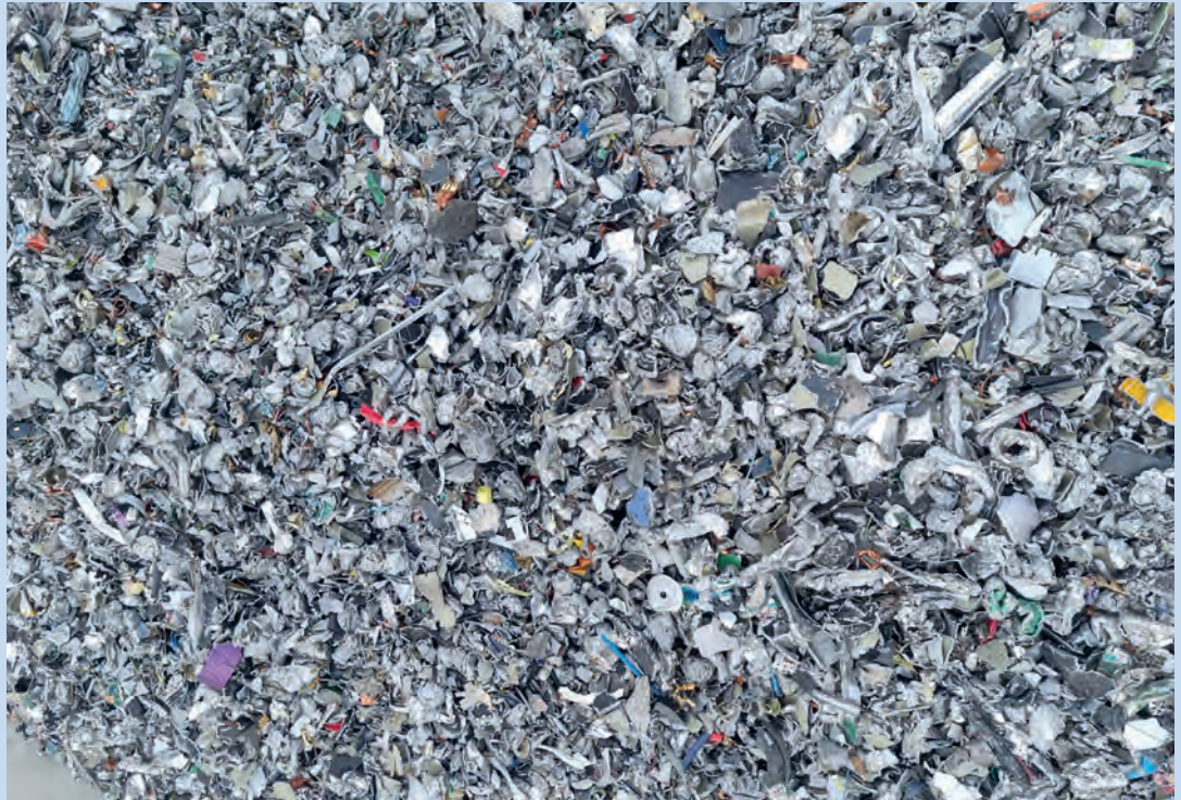
After the third and final sorting stage, zorba is readily available. Zorba is shredded aluminium which may contain lead, zinc, stainless steel, iron, brass, copper or nickel.

The shredder's slotted grid has also been significantly enhanced with an optimised arrangement of the openings. This makes the machine more wear-resistant and easier to maintain, important characteristics Envie was looking for. A second optimisation concerns the impurities slide. BHS-Sonthofen has adapted this component so that the RS can discharge impurities more smoothly through a larger gap, adding to the quality of the shredded material. Once the shredded mixed fractions exit the RS, an overbelt magnet helps to separate the metal from the non-metallic com-