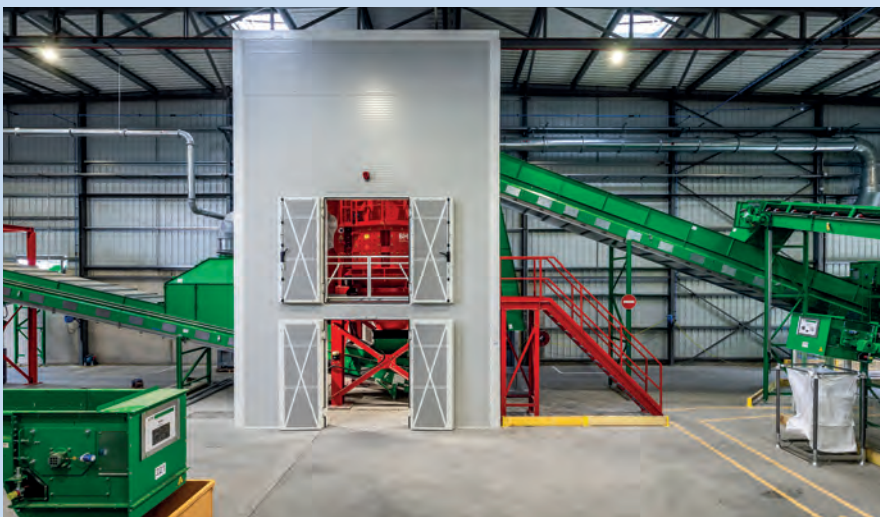
After the second stage in sorting Cabin 2, pre-sorted non-ferrous and ferrous materials are fed from the overbelt magnet to the enclosed BHS Rotorshredder for selective shredding and disintegration.

Important quantities of large objects and elastic materials can easily be processed in the VSR. It discharges the shredded material onto a conveyor belt which transfers the material to an overband magnet generating a mag-